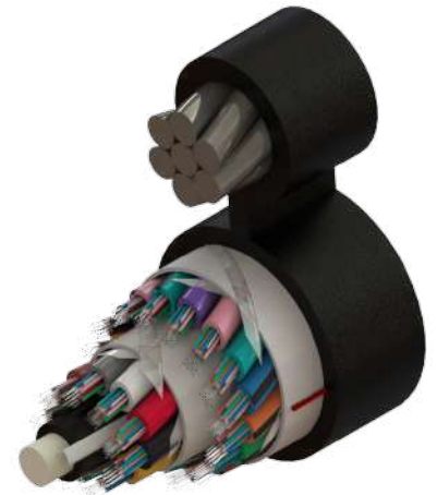
LT DRY F8 SLIM CABLE 1/4" 288F G652D DFT002 S EX

Two ripcords ensure a quick fiber access.